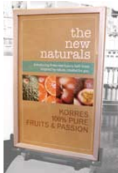
P.O.P.: 6 mil Poster Paper