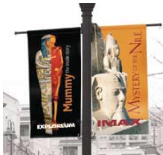
Light Pole Banners: 18 oz Reinforced Vinyl