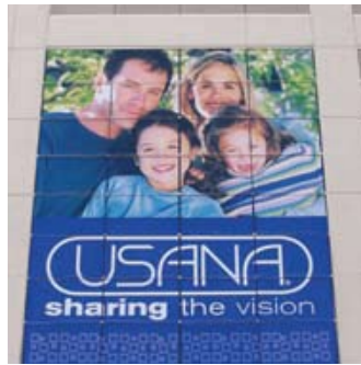
Building Wrap: Removable Adhesive Vinyl