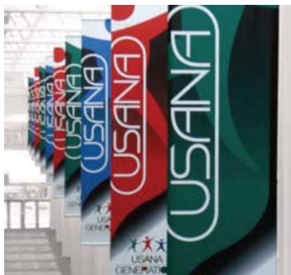
Special Event: Poplin

You will work directly with a knowledgeable Project Manager or KMG principal who is dedicated to your company -- that is why KMG is known for exceptional service and boasts one hundred percent client retention.