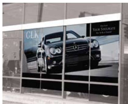
Outdoor Signage: Dacron