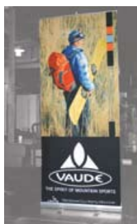
Retractable Banner Stand: Poly Duck