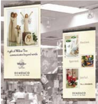
P.O.P.: Poly Duck