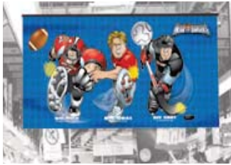
Retail: Celtic Cloth