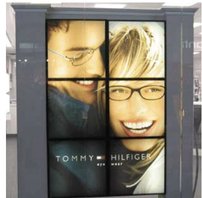
In Store: Backlit Trans

You will work directly with a knowledgeable Project Manager or KMG principal who is dedicated to your company -- that is why KMG is known for exceptional service and boasts one hundred percent client retention.