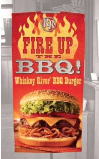
In Store: Poplin

With access to exclusive sublimation technology, we are able to produce fabric graphics that are vibrant in color and true to your original art. Our exceptional color management techniques allow us to isolate and adjust specific elements of a file.