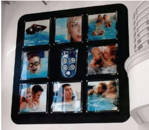
Environmental Graphic: Paper 2 nd Surface Mounted to Acrylic

KMG provides the highest quality continuous tone prints using state-of-the-art Lambda photographic equipment. We also offer lamination and offer a large selection of rigids and adhesives. When you need brilliant graphics for trade shows or point-of-purchase, Lambda offers unbeatable quality.