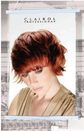
P.O.S.: Gloss Paper