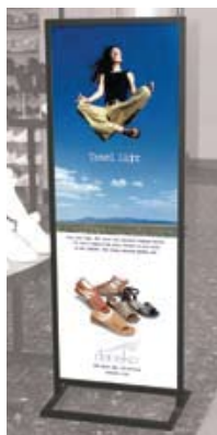
P.O.P.: Poly Duck