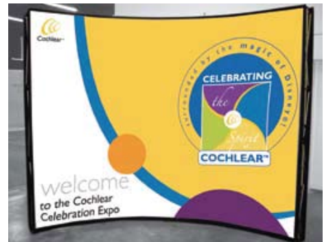
Trade Show: Flex w/5 mil Textured Front & 10 mil White Opaque Back