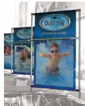
Environmental Graphics: Satin

Photo Fabric™ is a unique method for printing photo realistic prints on fabric using cutting edge digital printing technology. We offer three different options, depending on your width and project requirements.