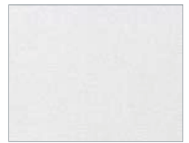
Closed Weave Fabric