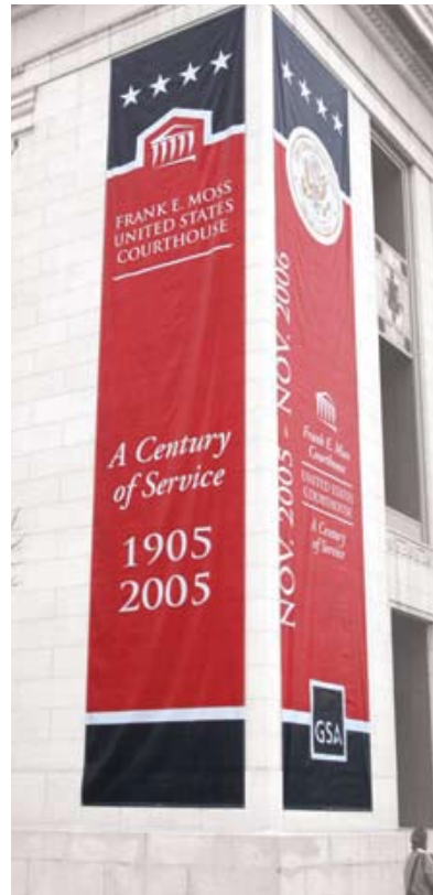
Outdoor Banners: 13 oz Reinforced Vinyl