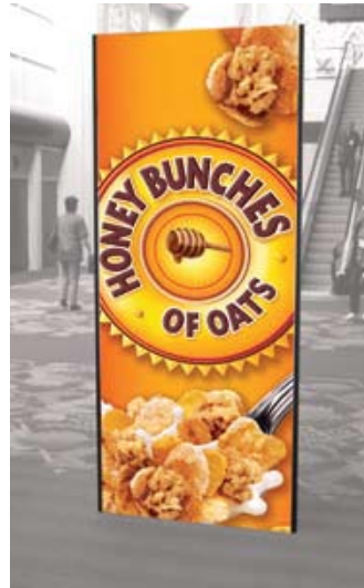
Special Event: Matte Paper Mounted to 3/16" Gator Foam