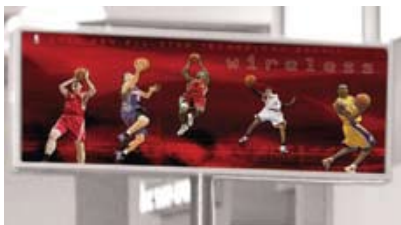
Retail Graphics: 13 oz Smooth Vinyl