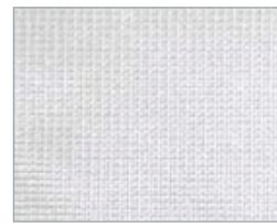
Open Weave Fabric

Our unequaled capacity allows us to produce jobs quickly without compromising quality.