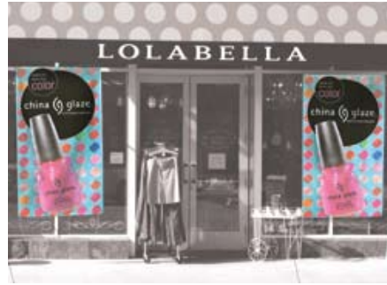
Outdoor Signage: Dacron

Digital Offset printing is a unique low cost method for producing superior quality fabric graphics. KMG offers two different options, depending on your requirements.