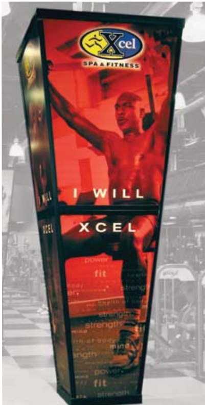
Environmental Graphics: Backlit Adhesive Vinyl Mounted to Acrylic

You will work directly with a knowledgeable Project Manager or KMG principal who is dedicated to your company -- that is why KMG is known for exceptional service and boasts one hundred percent client retention.